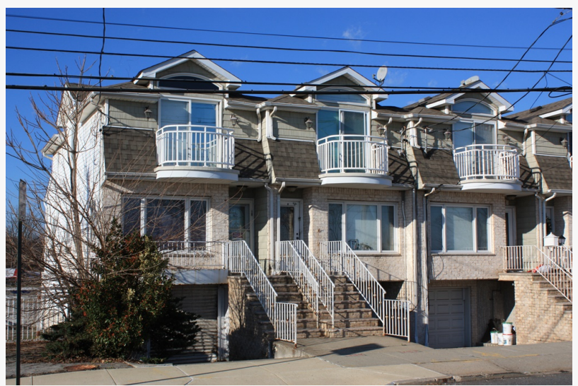
Fr Capodanno Blvd Units

Max Spann Real Estate and Auction Company, a national company with over 50 years of industry leadership, is America's premier real estate auction and advisory firm. Their Accelerated Auction Marketing Program creates urgency in the marketplace and allows sellers to control the terms and timing of the sale of their real estate assets. Learn more about Max Spann Real Estate &