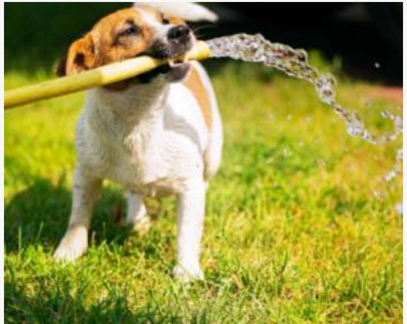
Keep Your Dog Cool

ElectricityOne.com - Save on Electricity Prices