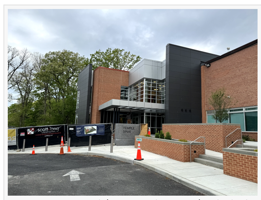
Metro DC commercial construction Temple, Sinai rain screen

About Scott-Long Construction Scott-Long Construction is a leader in the development and construction industry since 1961. Located in the Washington Metropolitan Region, Scott-Long Construction has built