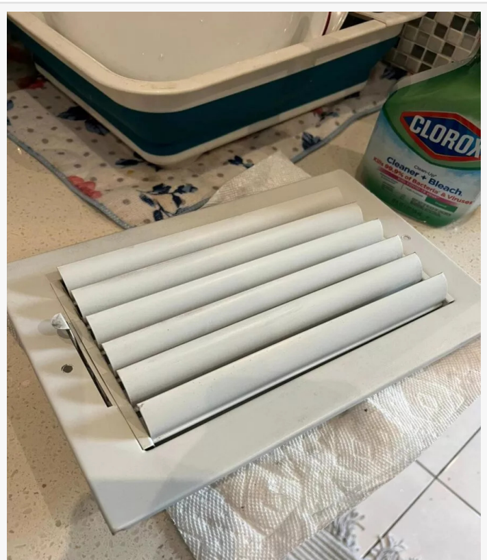
Maintain Air Vents and Ducts - Clean Quality Air

Clean Quality Air Air duct and Dryer Vent Cleaning +1 772-834-9618 email us here Visit us on social media: Facebook