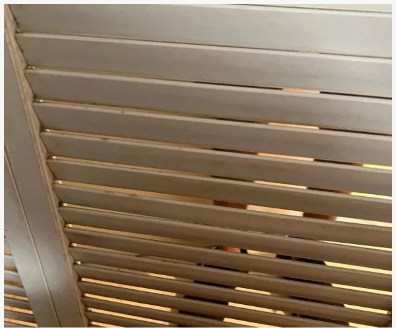
clean Qaulity Air - Air Duct Cleaning

/EINPresswire.com/ -- Clean Quality Air, which offers air duct cleaning services in Boynton Beach, FL , is pleased to announce that it now offers a more comprehensive suite of indoor air quality solutions. By expanding its service portfolio, the company aims to better serve the air quality needs of both residential and commercial clients in the local community.