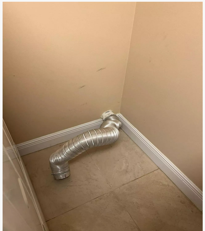
Air Duct Cleaning can Reduce Allergies