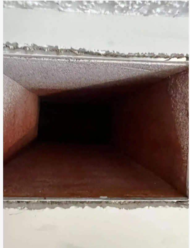
Air Duct Cleaning Services in Port St Lucie Clean Quality Air

A key benefit is alleviating spring allergies. As trees and plants release pollen into the air, indoor spaces can become breeding grounds if ventilation ducts are dirty. Trapped pollen particles continue to circulate and trigger sneezing and coughing. Fewer allergens mean relief from irritating and uncomfortable symptoms.