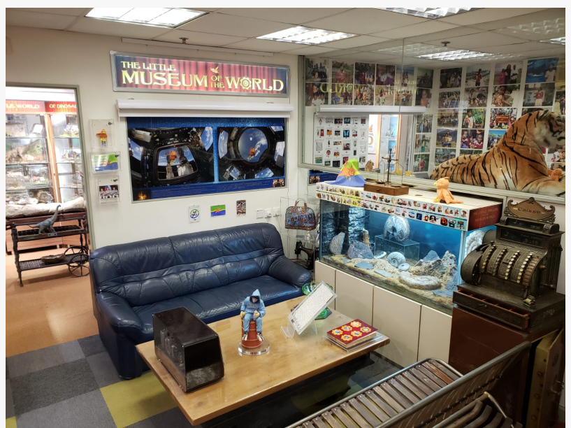
View of The Little Museum of the World where discovery and inspiration start

Christian Pilard The Little Museum of the World info@littlemuseumoftheworld.com Visit us on social media: Facebook LinkedIn Instagram