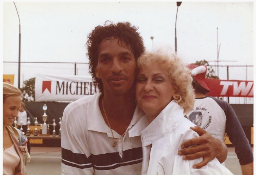
Proud Mom for The Champion

This press release can be viewed online at: https://www.einpresswire.com/article/718607437