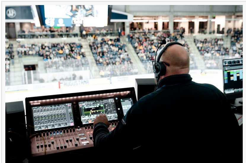
ZTransform delivered AV and media facilities to Augustana University's new Midco Arena

SEATTLE, WASHINGTON, USA, June 10, 2024 /EINPresswire.com/ -- ZTransform , a leading technology solutions provider serving the broadcast, sports venue, corporate new media, education, and government sectors, recently delivered AV and media facilities to Augustana University's highly anticipated Midco Arena, in time for launch of the Viking's NCAA Division 1 program, despite challenging time constraints.