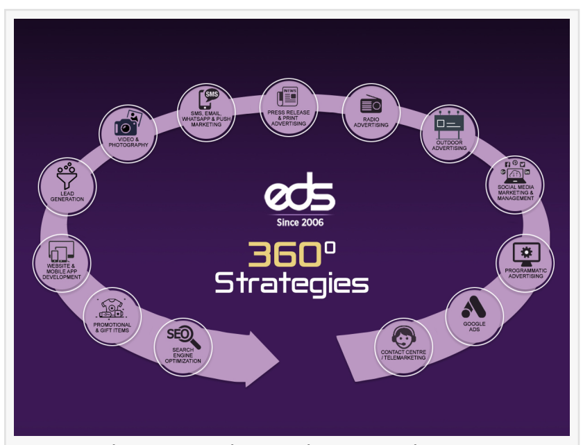
EDS Revolutionizes Client Solutions with Comprehensive 360 Degree Strategies

DUBAI, DUBAI, UNITED ARAB EMIRATES, June 10, 2024 /EINPresswire.com/ -- EDS, a trailblazing Social Media Marketing & Lead Generation Company based in Dubai, UAE, is excited to announce its groundbreaking transition to providing comprehensive 360-degree strategies and solutions to its esteemed clientele. This strategic evolution reaffirms EDS's commitment to delivering unparalleled online marketing solutions and exceptional digital marketing results for companies in the UAE and worldwide.