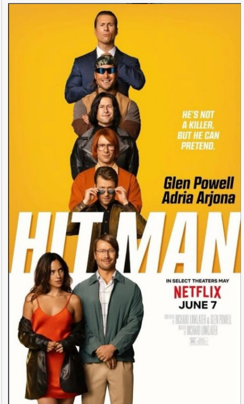
Hit Man Movie Poster