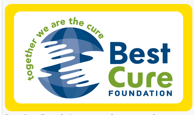
Best Cure Foundation — www.bestcure.md

has been proudly developing, manufacturing, and delivering reliable medical equipment and supplies for more than 40 years. TeamBest includes over a dozen companies offering complementary products and services for brachytherapy, health physics, medical physics, radiation therapy, blood irradiation, vascular brachytherapy, imaging, medical particle acceleration, cyclotrons, and proton-to-carbon heavy ion therapy systems. TeamBest is the single source for an expansive line of life-saving medical equipment and supplies. Its trusted team is constantly expanding and innovating to provide the most reliable products and technologies.