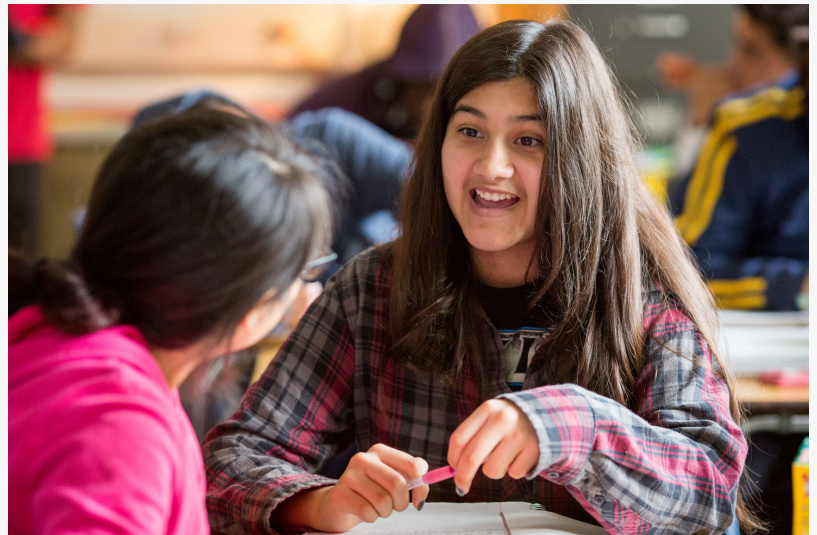
Students discuss IMPACTER responses to deepen their sense of purpose.