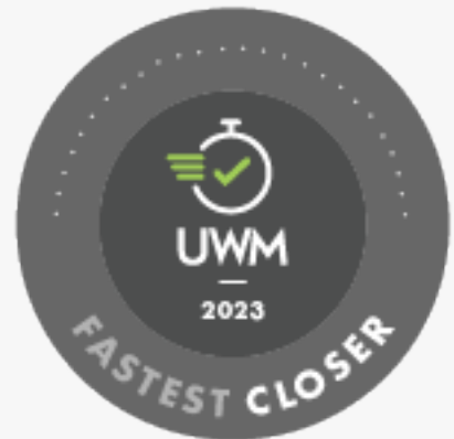
Fast Closer 2023