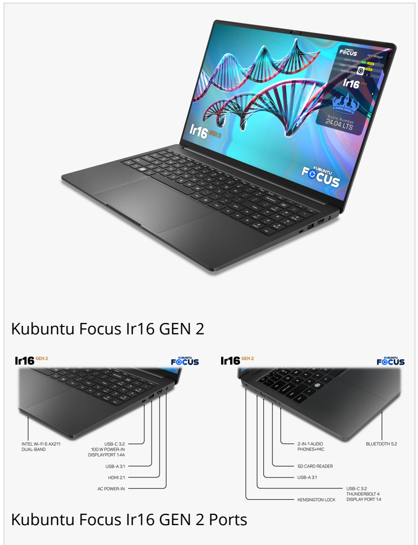
Kubuntu Focus Ir16 GEN 2

Designed to keep up even on long workdays, the powerful, quiet, and lightweight Ir16 GEN 2 laptop is equipped with an 80 Wh battery. All chassis surfaces are magnesium alloy, and the 16-inch display is colorful (100% sRGB LED IPS), tall (2560×1600, 16:10), bright (450-nit) and smooth (90 Hz refresh rate). The keyboard also includes a 10-key numpad.