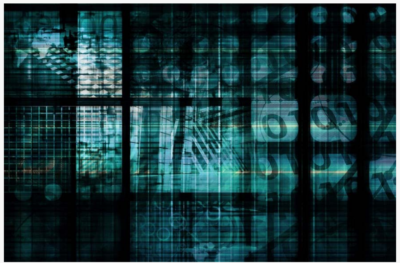
Managed IT provider Houston

and ever-changing IT landscape. “We’re about transformative change, we’re about change over time, about doing more with our processes, doing more with less through automation.”