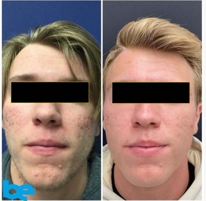
Acne Scar Treatment

This press release can be viewed online at: https://www.einpresswire.com/article/718903678