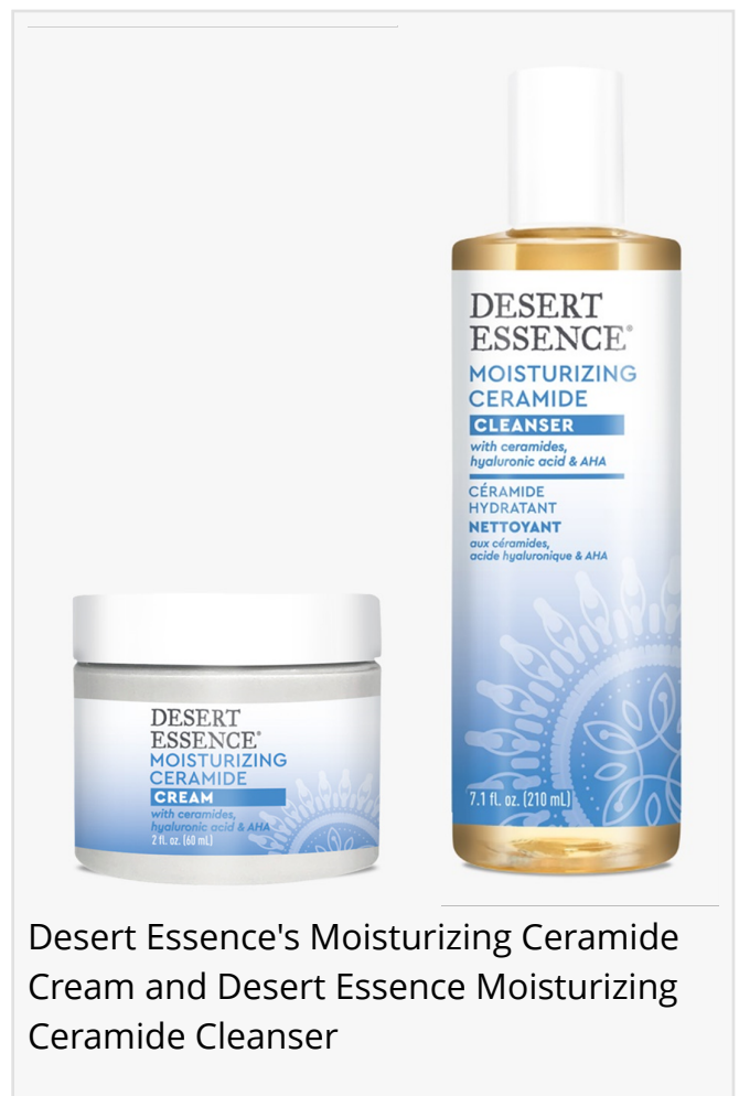
Desert Essence's Moisturizing Ceramide Cream and Desert Essence Moisturizing Ceramide Cleanser

This press release can be viewed online at: https://www.einpresswire.com/article/718927072