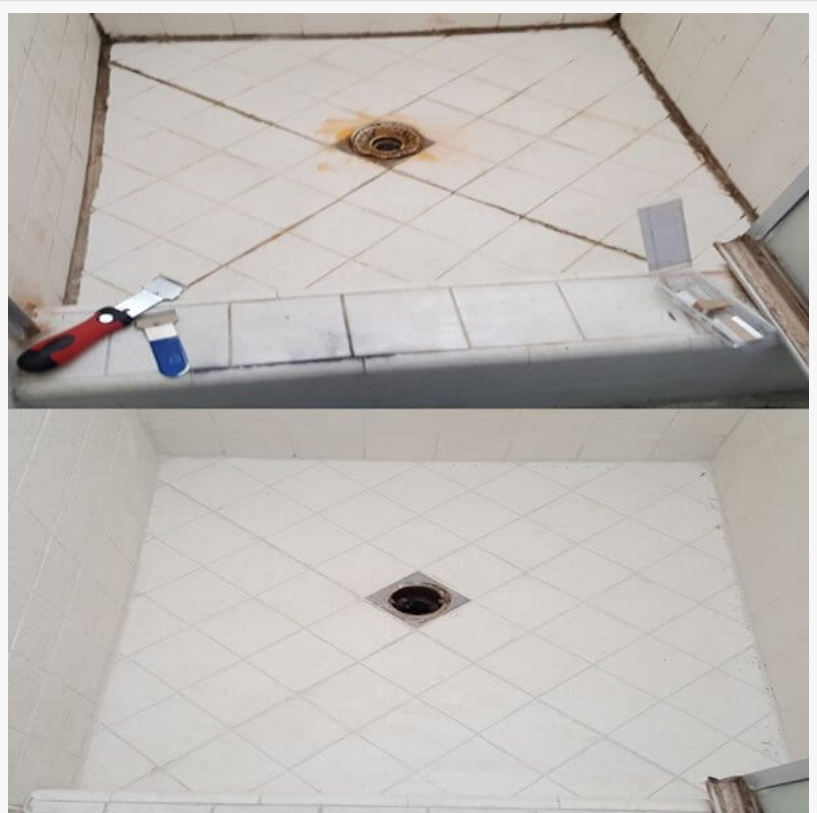
remove and replace damaged and cracked grout from the shower

Unsanded grout is easier to remove and less expensive, whereas epoxy grout, which offers