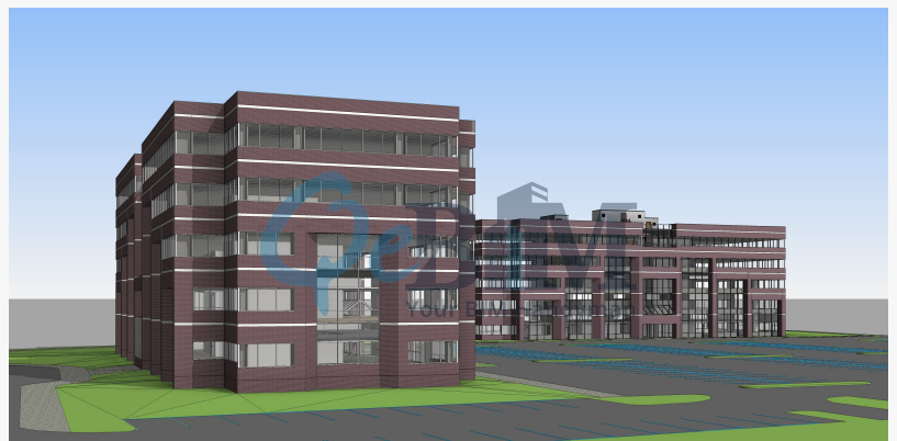
Architectural BIM Model for Office Building