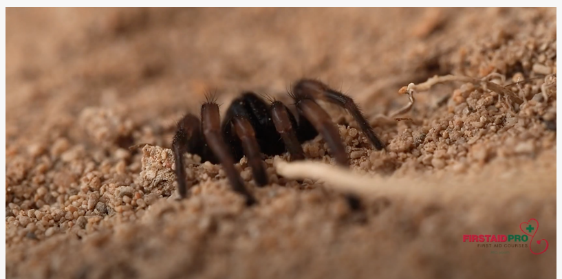
Is A Huntsman Spider Bite Dangerous?

ADELAIDE, SOUTH AUSTRALIA, AUSTRALIA, June 11, 2024 /EINPresswire.com/ -- In Australia, the idyllic outdoor lifestyle comes with a hidden risk, venomous and potentially dangerous insect and spider bites.