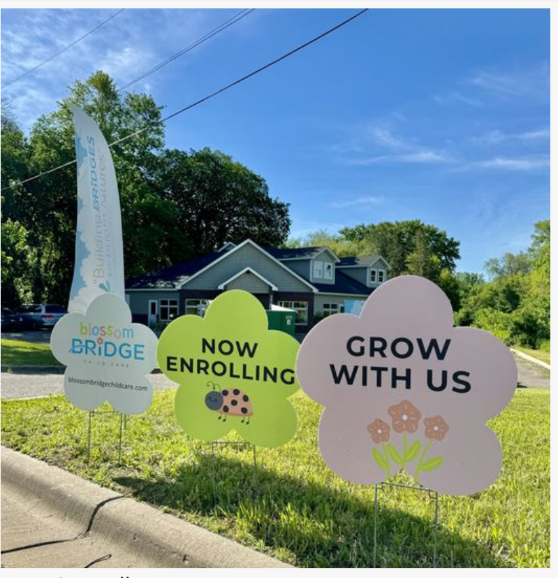
Opening Fall 2024

Blossom Bridge's mission is to provide a nurturing environment where every child's potential is celebrated and cultivated through experiential learning with a play-based approach. As a family-