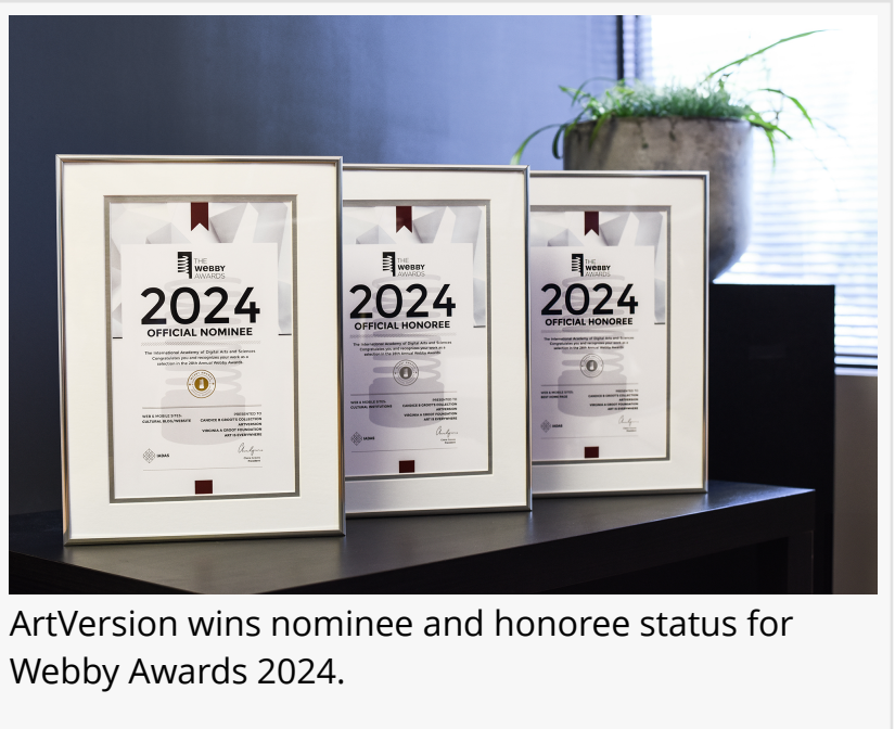
ArtVersion wins nominee and honoree status for Webby Awards 2024.