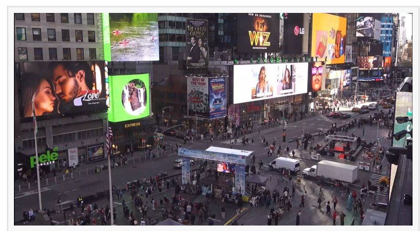
Forbidden Love on Times Square, New York

As Stella finds herself in a forbidden romance with Father Richard, their story becomes a complex tapestry of