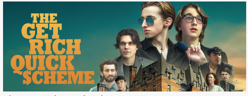
The Get Rich Quick Scheme - Banner

skills, how friendships can change or be destroyed by the idea and potential of success, and how greed influences choices. Can the three high school friends scale their new business to meet their goal, and will their friendships survive the pressure, or will the principal's plan to sabotage them succeed?