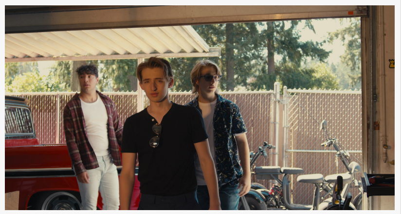
The Get Rich Quick Scheme - Still 2.Group