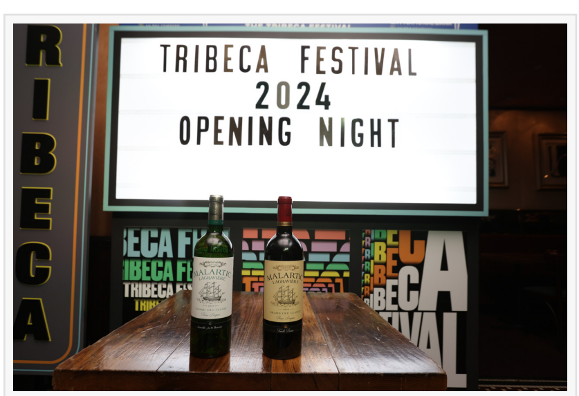
Château Malartic-Lagravière Malartic White 2019 and Malartic Red 2016

The Tribeca Film Festival, co-founded by De Niro, is an annual event held in New York City, which was initiated to re-inspire lower Manhattan after the 9/11 World Trade Center attacks. It celebrates several narratives in various