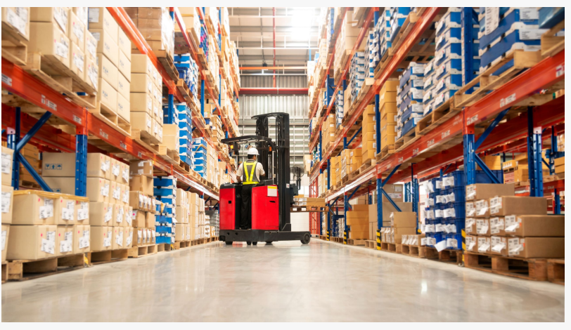
Fast delivery for restaurant equipment and supplies

Fruits and vegetables have seen a 1.7% year-over-year price increase (source: USDA.org). Smart refrigeration units and inventory tracking software are now indispensable for controlling these costs. These technologies maintain optimal freshness and prevent overstocking, ensuring efficient inventory management.