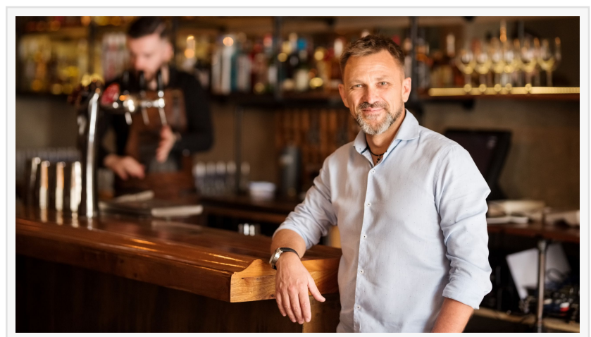
Restaurant Supply Store Sees Surge Despite Economic Slowdowns - Rising Food Costs

LOS ANGELES, CALIFORNIA, UNITED STATES, July 1, 2024 / EINPresswire.com/ -- As food prices soar and economic challenges mount, restaurant managers across the nation are making strategic investments to stay afloat. With rising costs threatening profitability, the right choices are proving to be gamechangers in the industry.