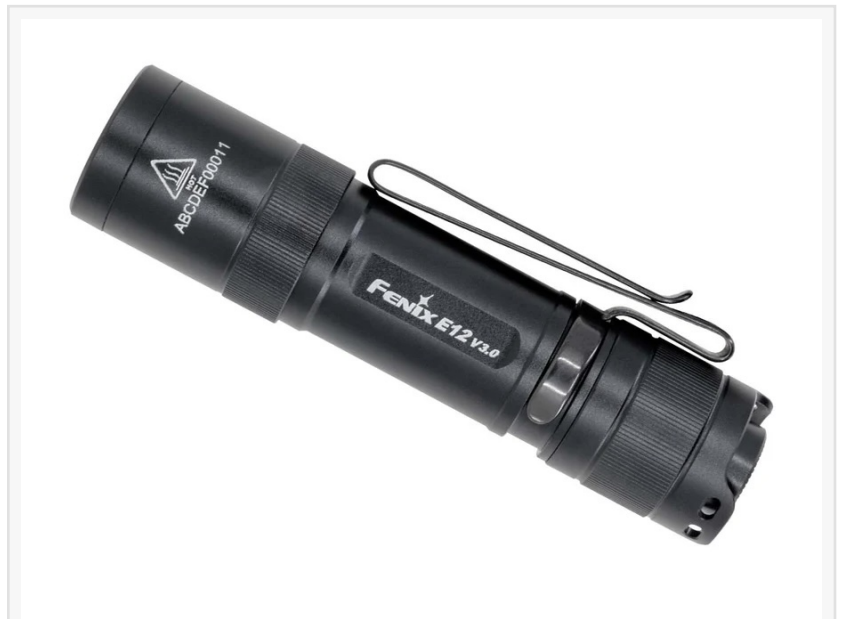
Enhanced E12 V3.0 AA-Powered EDC Flashlight

*Magnetic Tail Switch: New to the V3.0 is a magnet integrated into the tail switch, offering versatile, hands-free lighting options. This feature is perfect for tasks requiring both hands or for attaching the flashlight to most metal surfaces.