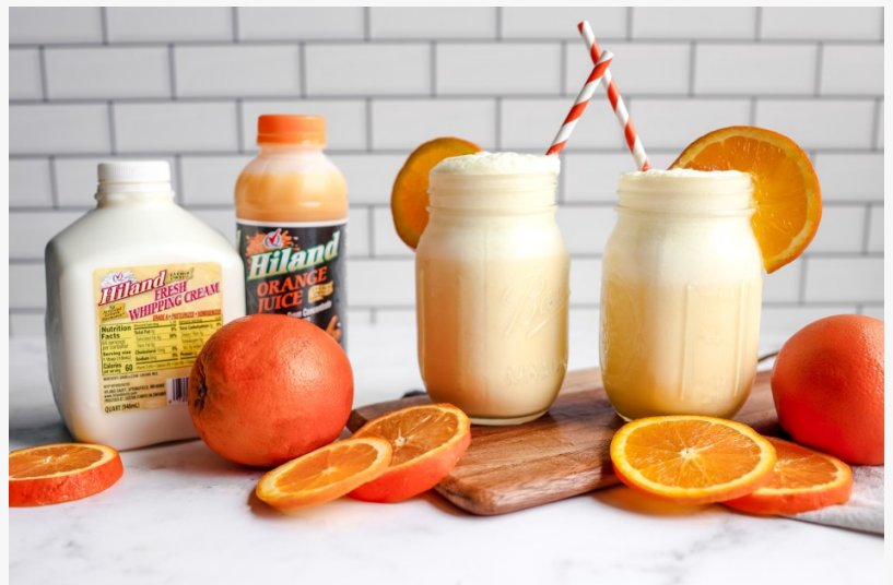
The classic and nostalgic flavor from Hiland Dairy of creamy orange and vanilla bringing back childhood memories