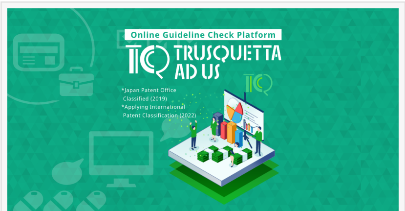
“TRUSQUETTA AD US”

The issue of exaggerated advertising has become a growing concern in both Japan and the United States. To address this problem, we have developed TRUSQUETTA AD US, a tool that