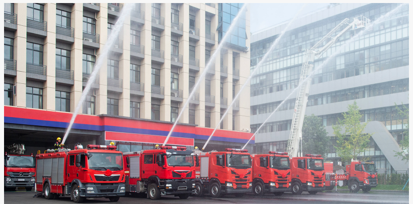
Water Fire Truck