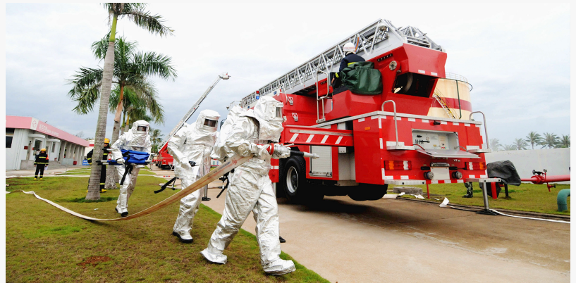
Aerial Fire Truck