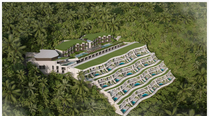
Bali Family Development, Golden Pearl

UBUD, BALI, INDONESIA, June 13, 2024 /EINPresswire.com/ -- Bali, often hailed as the "Island of Enchantment," stands as a tropical paradise that beckons countless travellers each year. Consequently, Bali's real estate sector thrives, presenting investors with a rare chance to embrace the island's allure and potential for expansion.