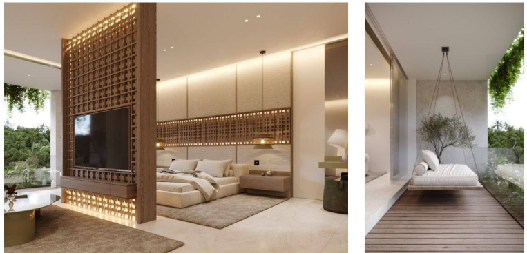
1 BD apartment, Golden Pearl, Price: $252,000. With jacuzzi, 96 m2, Rental income 18%, Resale profit 40%