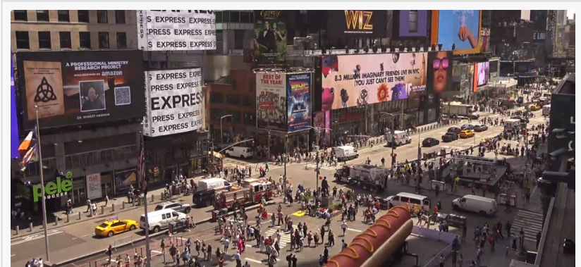
The Impact Of Understanding One's Being In Christ For Empowerment In Ministry on Times Square, New York