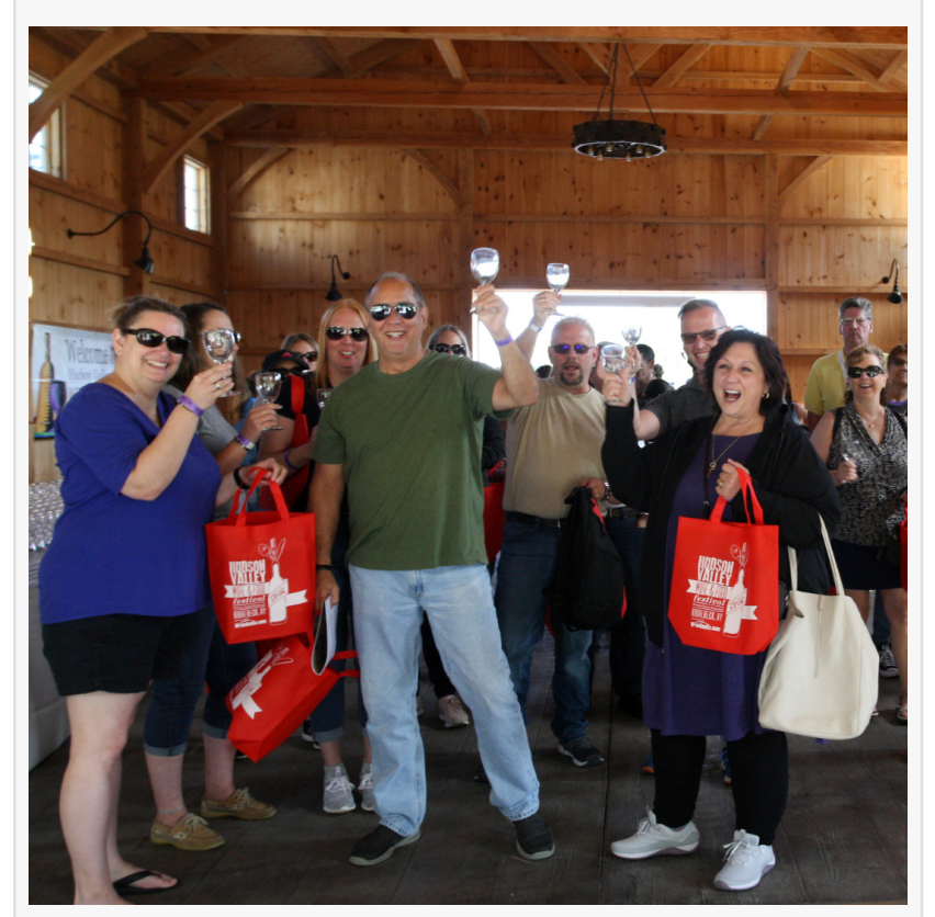
Guests arriving at the Wine Fest with commemorative glass in hand

Wine! Food! Fun! At the 2024 Hudson Valley Wine & Food Festival