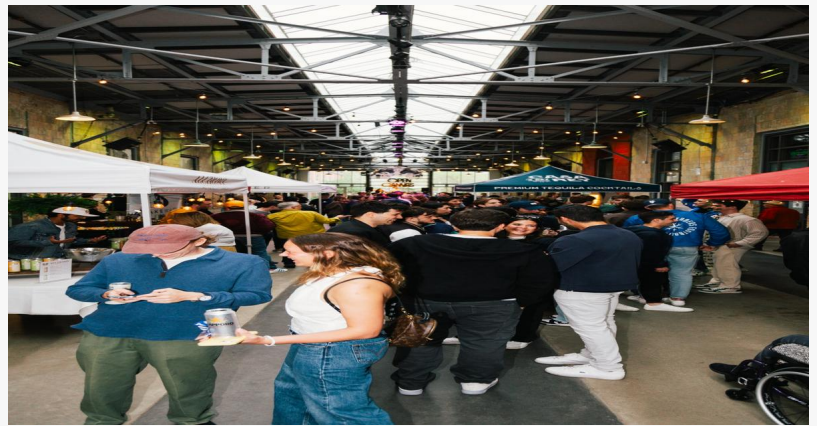
Open Canvas event bustling with conversations and connections.

Open Canvas is built on three pillars. First, it supports ambitious local and international musicians and DJs who stay true to themselves. Second, it strives to remove barriers and focus on marginalized communities, ensuring accessibility for all. Third, it collaborates with local visual artists to create immersive experiences connecting music with diverse expression forms.