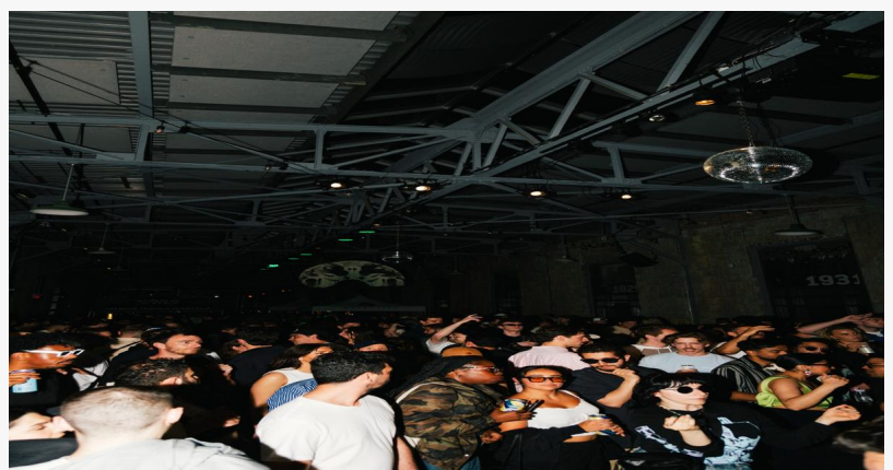
A crowd of people at an indoor event, with a disco ball hanging from the ceiling.

TORONTO, ONTARIO, CANADA, June 12, 2024 /EINPresswire.com/ -- The much-anticipated Open Canvas Music & Arts Festival launches in Toronto this summer. It aims to revolutionize the city's music and arts scene with a commitment to accessibility, community, and diverse artistic expression. Scheduled to kick off with an event on June 22 at Daniel's Spectrum, this festival promises to bring Torontonians an inclusive cultural experience.