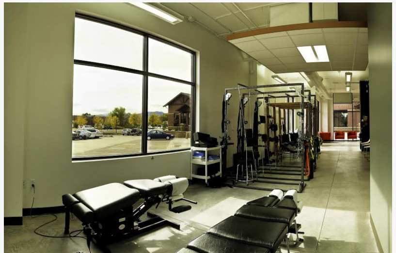
Treatment Equipment at Square One Health