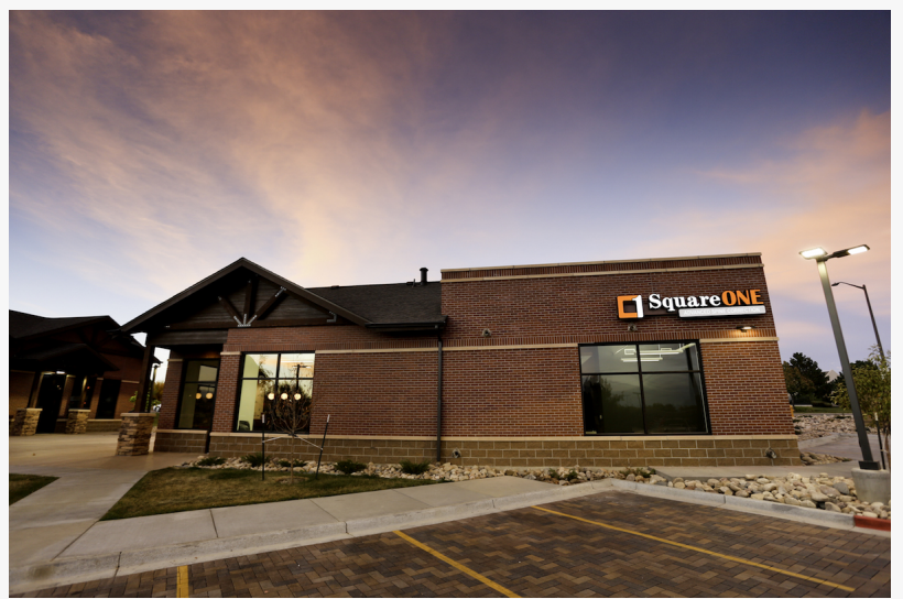
Square One Health Clinic

ScoliBalance is a scoliosis-specific physiotherapeutic rehabilitation program. The International Society on Scoliosis Orthopedic and Rehabilitation (SOSORT) have 4 criteria for a scoliosis-specific exercise program: 1) It must teach the patient 3D autocorrection where the patient is taught to put their spine in a corrected position. 2) It must involve strengthening and stabilizing exercises. 3) It must incorporate correction in activities of daily living. 4) It must involve patient education. ScoliBalance meets all 4 of these criteria. Emma's Level II certification allows her to