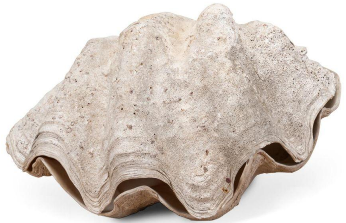
Large Tridacna gigas clam shell, complete with both halves, an adult sessiled pair with the remains of the connective tissue that hinged the two halves of the shell when still alive ($3,933).

This press release can be viewed online at: https://www.einpresswire.com/article/719472325