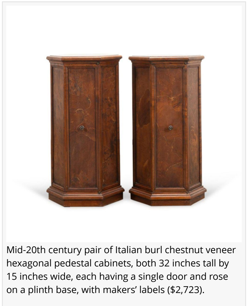
Mid-20th century pair of Italian burl chestnut veneer hexagonal pedestal cabinets, both 32 inches tall by 15 inches wide, each having a single door and rose on a plinth base, with makers' labels ($2,723).

Jamia Berry Ahlers & Ogletree, Inc. +1 404-869-2478 email us here