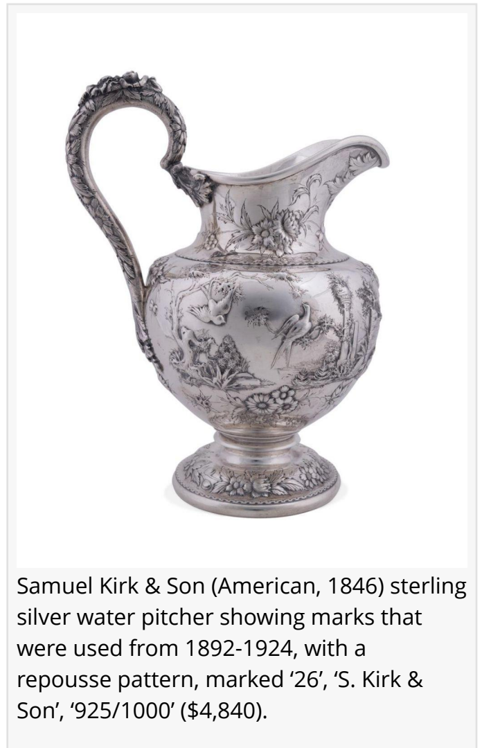
Samuel Kirk & Son (American, 1846) sterling silver water pitcher showing marks that were used from 1892-1924, with a repousse pattern, marked '26', 'S. Kirk & Son', '925/1000' ($4,840).

Ahlers & Ogletree is a multi-faceted, family-owned business that spans the antiques, estate sale, wholesale, liquidation, auction and related industries. Ahlers & Ogletree is always seeking quality consignments for future auctions. To consign a single item, an estate or a collection, you may call