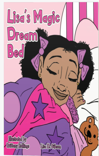
Lisa's Magic Dream Bed

Central to the story is Lisa, whose imagination takes her to a world where a bed becomes a portal to enchantment. With a headboard