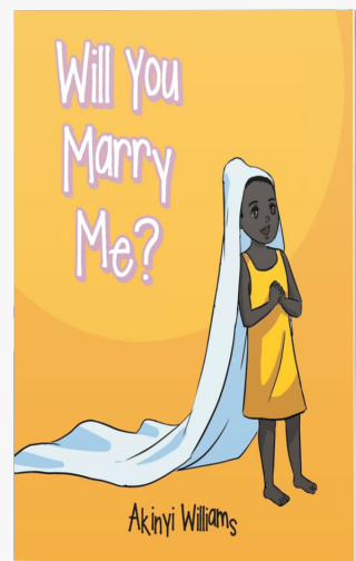
Will You Marry Me?