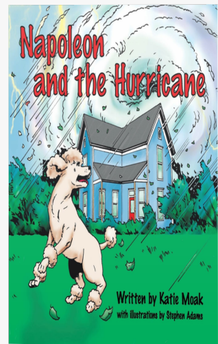
Napoleon and the Hurricane

Culminating this immersive literary ride, Katie Moak extends an invitation to an incredible voyage of friendship and survival in "Napoleon and the Hurricane." With stunning illustrations by