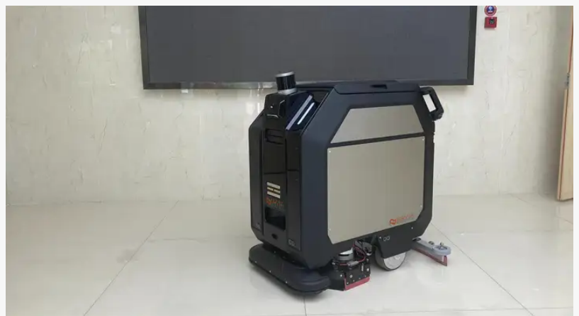
Navia Robotics Scrubber 60 - Autonomous Floor Scrubber Robot cleaning a hotel lobby