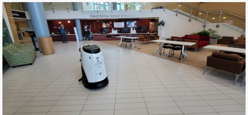
Navia Robotics Scrubber 50 - Autonomous Floor Cleaning Robot cleaning hotel lobby