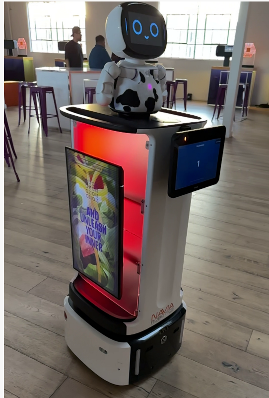
Navia Robotics ColliBot - Hospitality Receptionist Robot with room service and receptionist capability