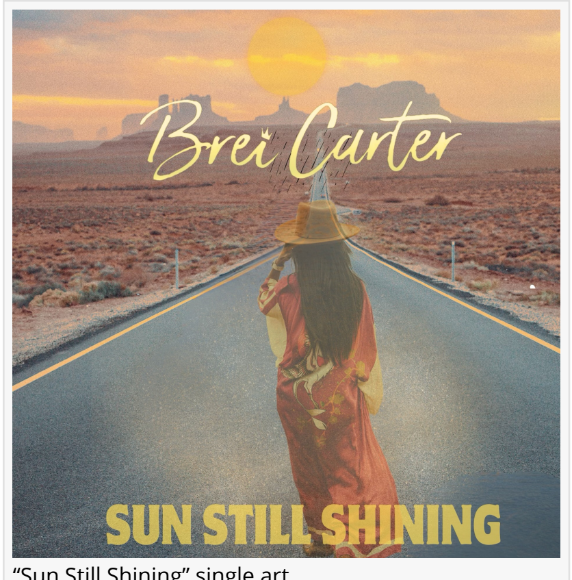
"Sun Still Shining" single art

"A Brei of Fresh Air is more than just an EP; it's a heartfelt journey through my