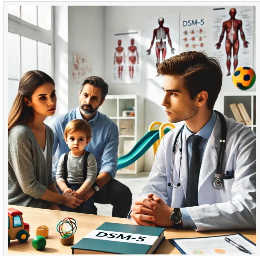
Are we overdiagnosing?

"While it is crucial to identify and support children with genuine developmental needs, we must also recognize that over-classification and diagnosis can harm resilience in kids and reduce their sense of agency. Accurate and thoughtful diagnostic