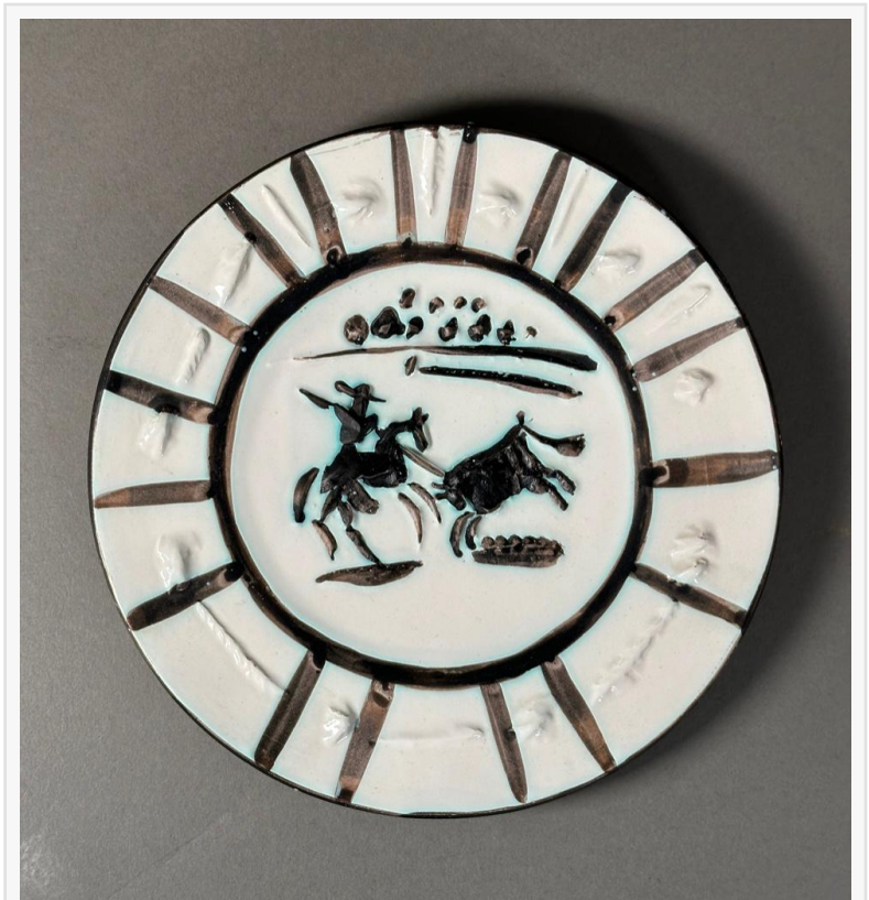
The two Picassos in the auction include this white earthenware with black oxide and white enamel glaze ceramic charger titled Picador (1953), #117 of 200 (est. $2,000-$4,000).