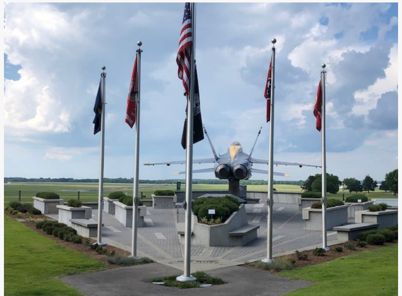
The Sub Memorial will be in this park in Smyrna, TN which honors all veterans