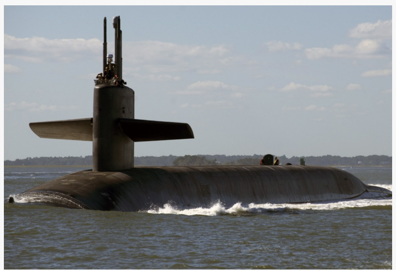
The sail (superstructure) will be donated to the Memorial Park on decommissioning

The TSMA charter also includes taking presentations on the U.S. Submarine Force to schools and organizations around the state, to educate the public and youth about submarines and submariners.