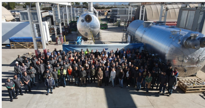
Nikkiso Cryoquip, LLC (Murrieta, CA) Headquarters

This press release can be viewed online at: https://www.einpresswire.com/article/719762525