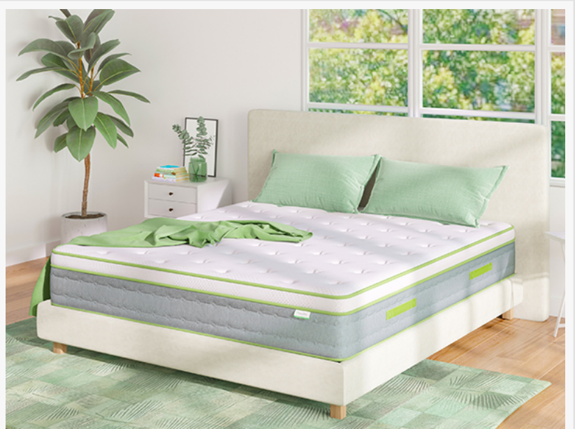
A cozy home made simple

This press release can be viewed online at: https://www.einpresswire.com/article/719880289