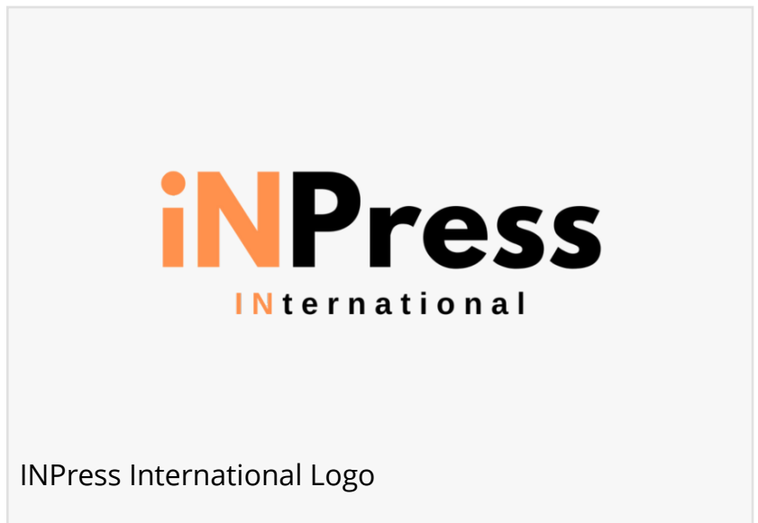
INPress International Logo

This press release can be viewed online at: https://www.einpresswire.com/article/719900156