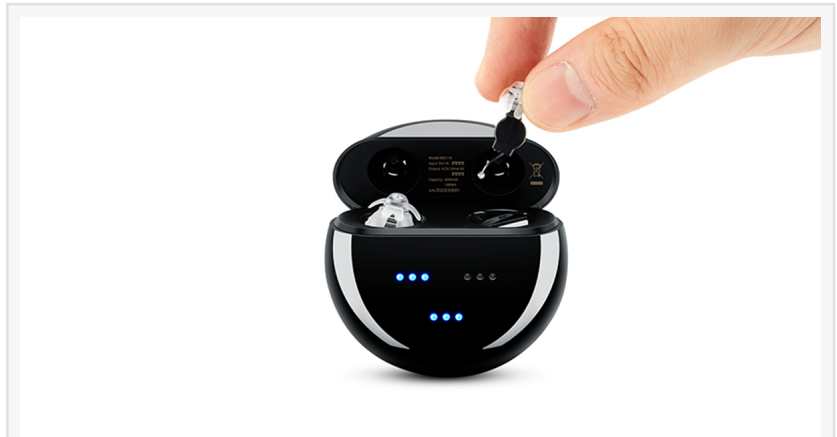
SmartU Rechargeable OTC Hearing Aids

Traditionally, the classic behind-the-ear (BTE) hearing aids, featuring a shell behind the ear and a tube leading to a dome in the ear, have been the go-to solution for significant hearing loss.