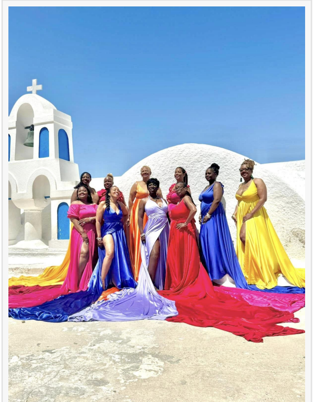
Culture Holidays-Flying Dress in Greece