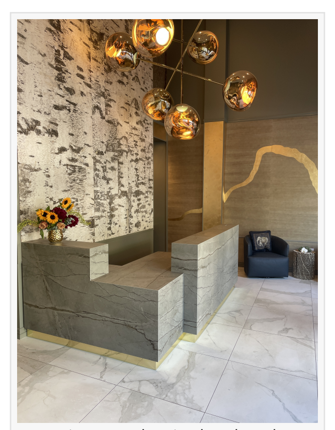
Reception area showing hand made wallpaper, custom made porcelain desk, designer lights, marble flooring, natural bark wood panelling