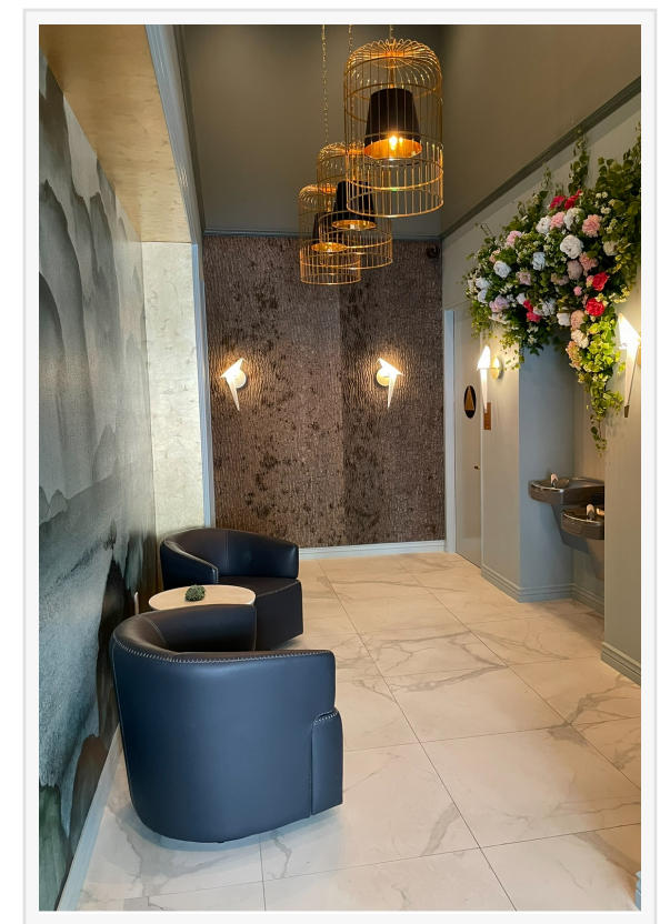
Waiting area with handmade wallpaper, bark wood panelling, marble floor, birdcage lights, floral decor

Liza Evans Mount Street Design + Build +1 415-283-8373 liza@mountstreetsf.com Visit us on social media: LinkedIn Instagram