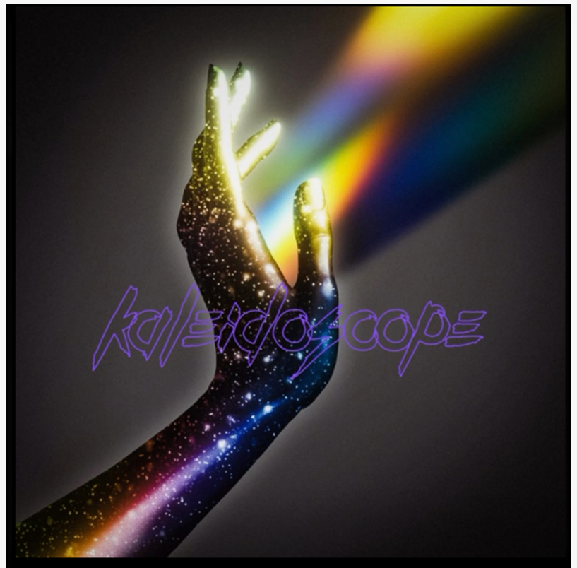
Kaleidoscope - The Latest Single From Generations