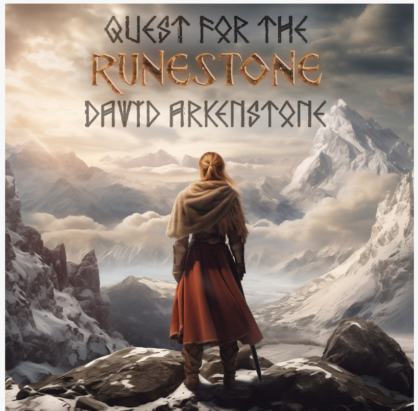
Quest For The Runestone