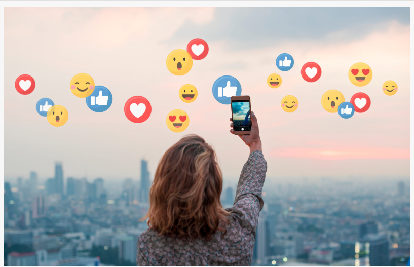
Increase Exposure, Grow Following, Monetize

A social media influencer, usually referred to as simply an influencer, can be any individual with a