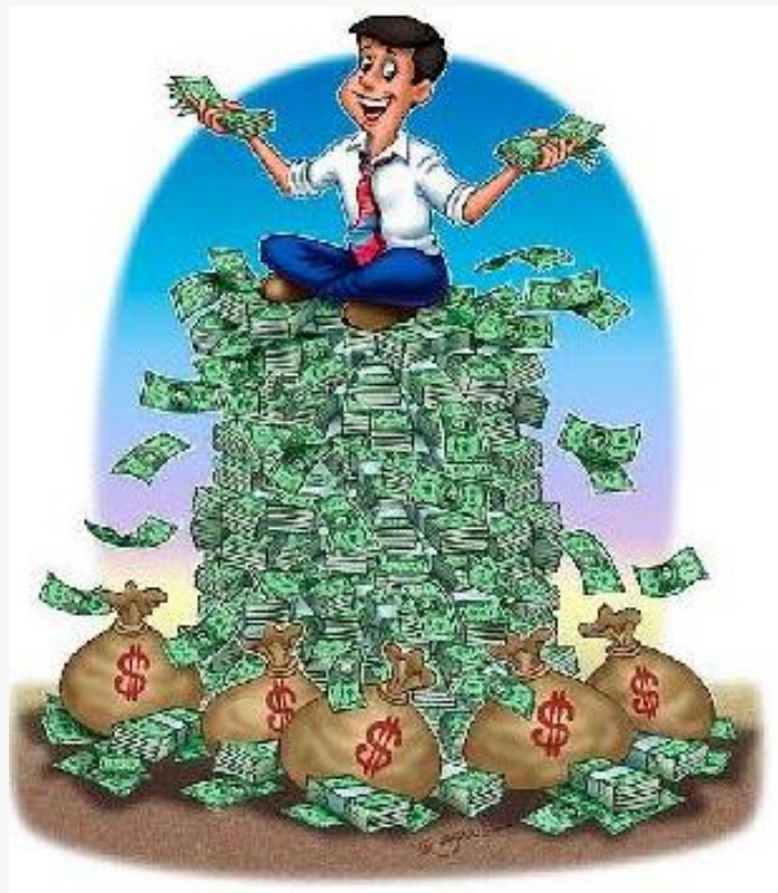
Charitable Opportunities Await